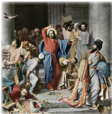
Illustration: Jesus casting out the money changers at the Temple Carl Bloch (1834-1890)